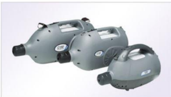
Modern ULV Foggers